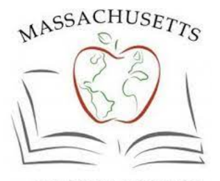
COUNCIL FOR THE SOCIAL STUDIES

Massachusetts Council for the Social Studies is now accepting exhibitors and workshop proposals for their Fall Statewide Conference which is slated for October 22-23, 2023.