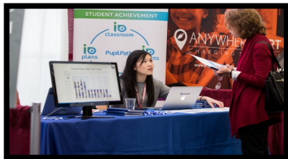
Exhibit Booth – $2,100

Exhibits are set up on the East Side Putnam Club Level of the stadium. Booth set up includes: 8' x 10' pipe and drape booth, one 6ft skirted table, two chairs, trash barrel, standard electrical (5 amps), exhibitor dedicated wi-fi and two complimentary staff registrations. An Exhibitor Services Manual with additional information on ordering booth materials, electrical, shipping instructions, etc. will be sent with your confirmation.